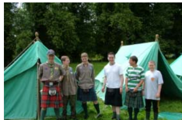
Get Connected! (Philosophically)