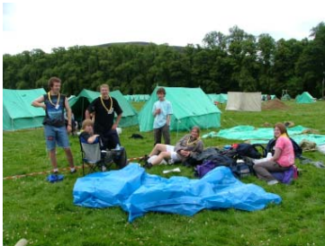
Rootin' Tootin' Inconsistency