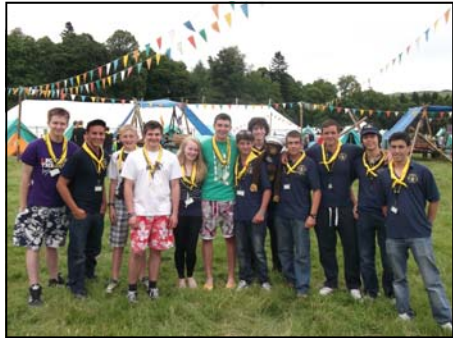
Stirling & Trossachs and Gibraltar