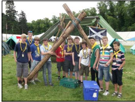
East Lothian and Russia