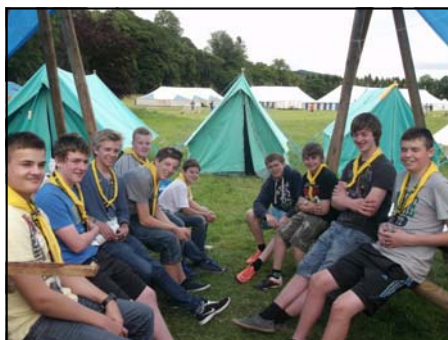
Borders and Norway 3