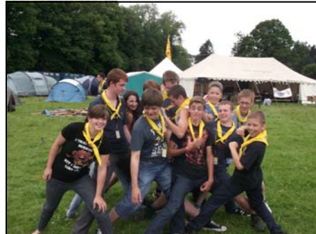
West Lothian and Canada & Quebec