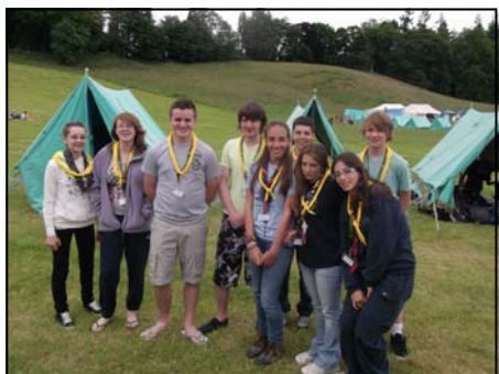
South Angus and Spain