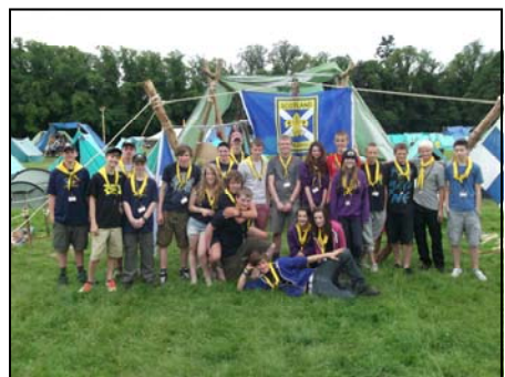
Dumfries and Finland